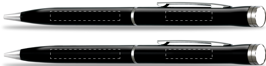
FULL COLOR EPOXY DOME