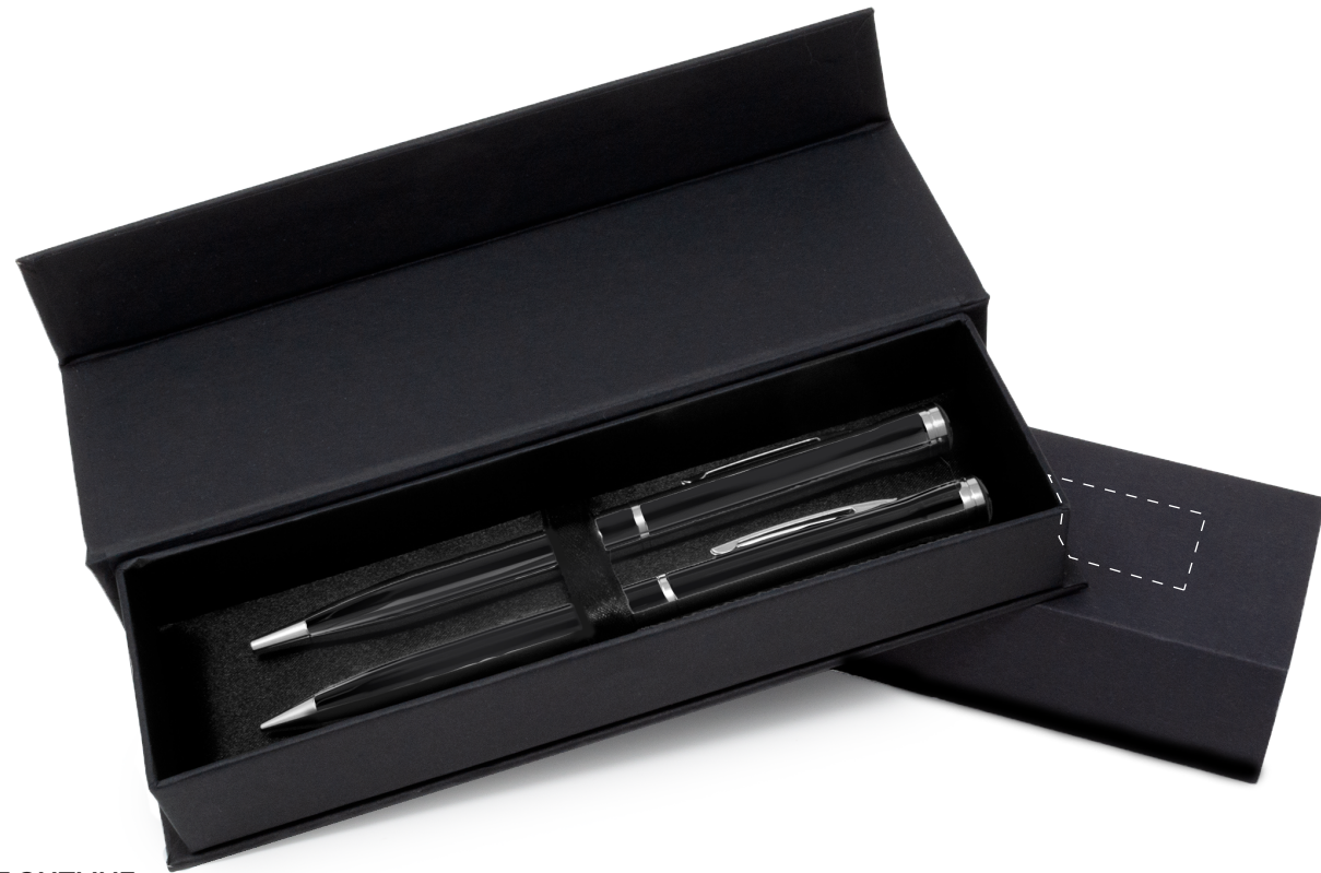
BOX IMPRINT OUTLINE