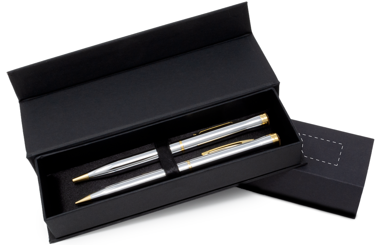
GOLD PENCIL AVAILABLE FOR MIX AND MATCH